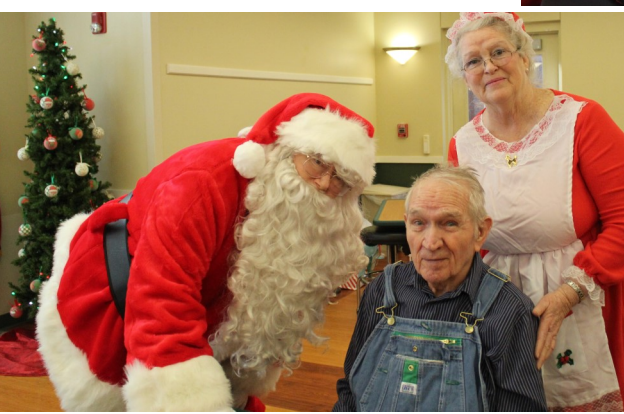
We had a glorious holiday season 2019.

Many thanks to everyone involved and to everyone who attended the neighborhood parties.