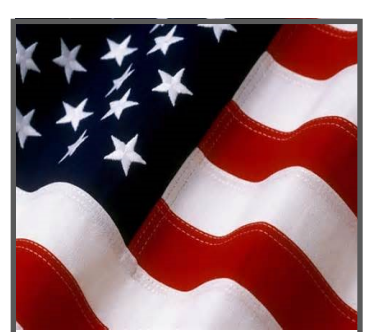
VOLUME 7 ISSUE 3 JULY AUG SEPT 2023