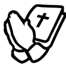
(74) Faith and Prayer