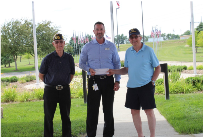
Monetary donation from the American Legion Post #1 Omaha