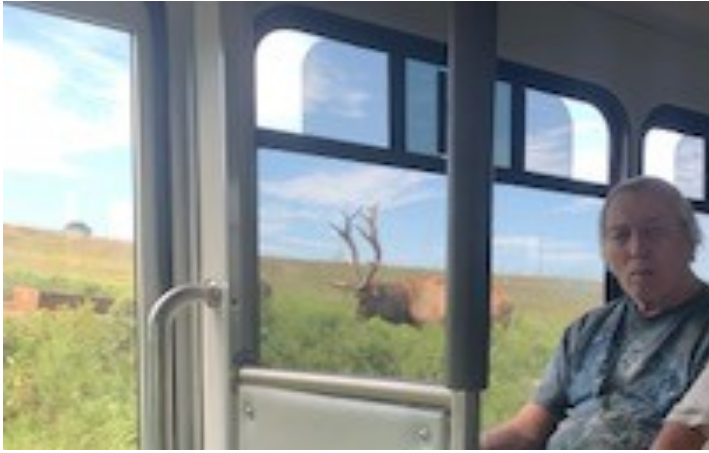
Bus Ride to the Wild Life Safari See the Elk, standing outside