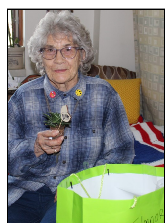
Alice Buffet Magnet Middle School in Omaha.

44 Members were given gift bags filled with a variety of items like fleece blankets, puzzles, treats and a note from each of the 8th grade students.