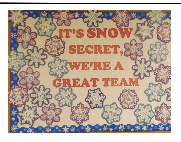
A photo of one of the neighborhood's bulletin board.