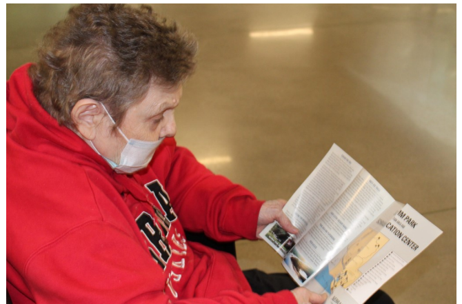
The top two photos were taken during a recent visit to the Schramm Park State Recreation Area.