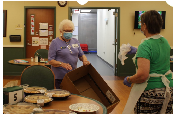
Lower photos were taken during a recent ice cream and pie social sponsored by the VFW and Auxiliary of Fremont.