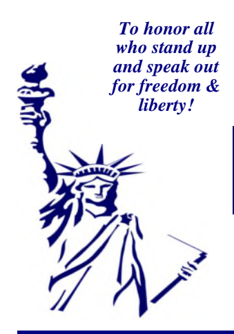
Page 2 Administration Notes