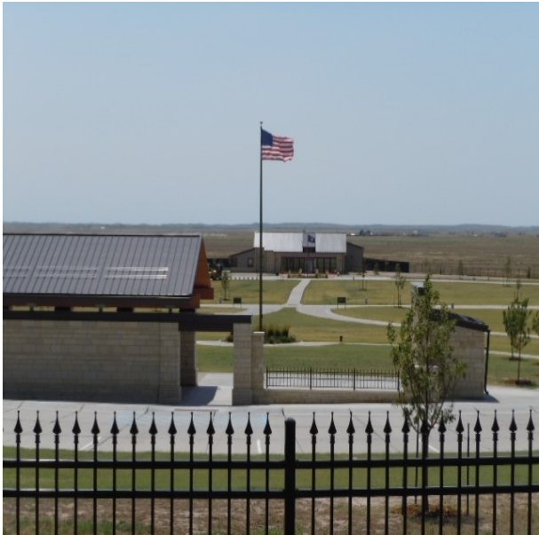
The Committal Shelter is in the foreground. The Administration Building is in the distance. Below are shadow boxes memorializing veterans that have been interred at the cemetery.