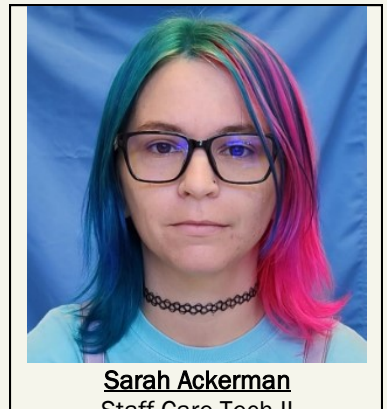
Staff Care Tech II