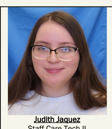
Staff Care Tech II