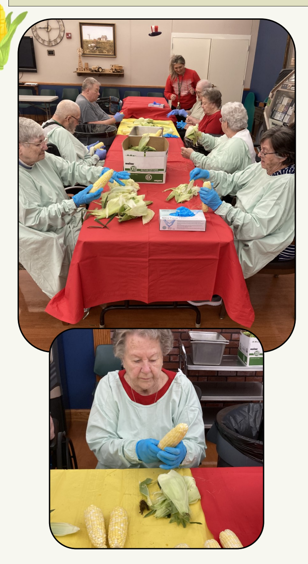
Members shucked corn for their grilled hamburger and sweetcorn feed.