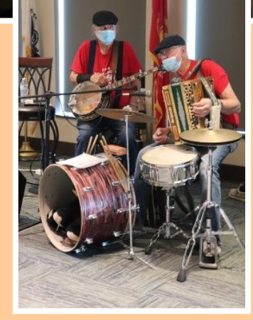
The Oktoberfest Polka Party was sponsored by the Kearney Elks!

Members enjoyed music by the "Polkaholics" band!