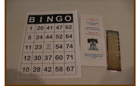
Members joined the Nation in ringing bells in celebration of Constitution Day, with the bingo also sponsored by the D.A.R.