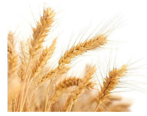
We have many farmers that live here at CNVH, so we enjoyed playing Harvest Time Bingo and learned about some different kinds of tractors. This activity was sponsored by the ALA.