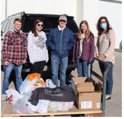
Students obtained a grant from Thrivent and purchased items on our Wish List.