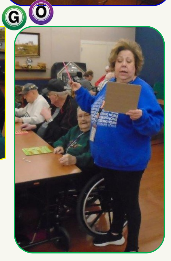
Norfolk American Legion Family sponsored BINGO.