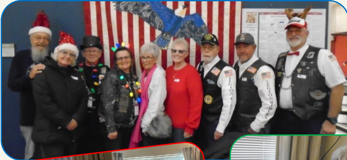
The Norfolk American Legion Riders strolled throughout the facility handing out cards and goodies to the members.