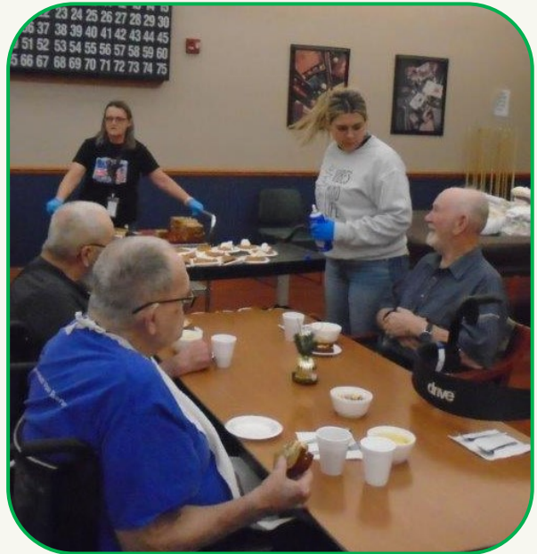
Nebraska Dept. of Disabled American Veterans Auxiliary hosted their yearly Oyster Soup Feed for the members.