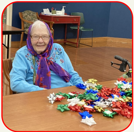
The ALA sponsored a Red Hat Christmas party for the ladies. They enjoyed playing 'Christmas Themed' games.