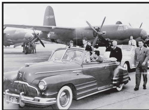
Above shows a photo of President Franklin D. Roosevelt visiting the plant in 1943.

The Glenn L. Martin Bomber Plant became operational on January 1, 1942 and focused on production of B-26 Marauders and, later, B-29 Superfortresses. In total, 531 B-29s were manufactured by the plant, representing nearly 13.5% of all B-29s produced in the country. Two of the B-29s produced at the plant were the "Enola Gay" and "Bockscar," which would be used to drop atomic bombs on Hiroshima and Nagasaki.