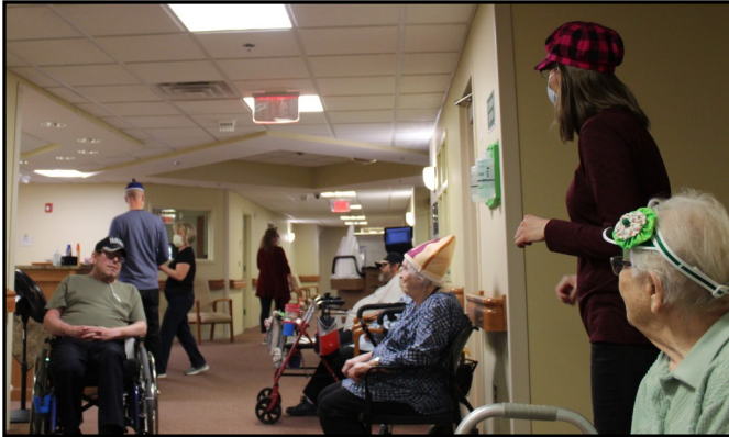
Wearing hats one day