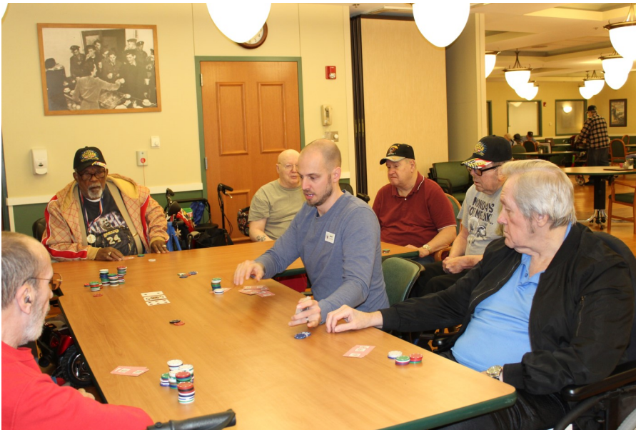
Playing Texas Hold 'em