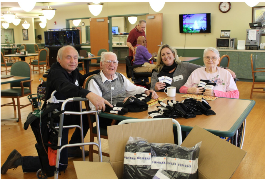
Large donation of Bombas Socks from DJ's Dugout