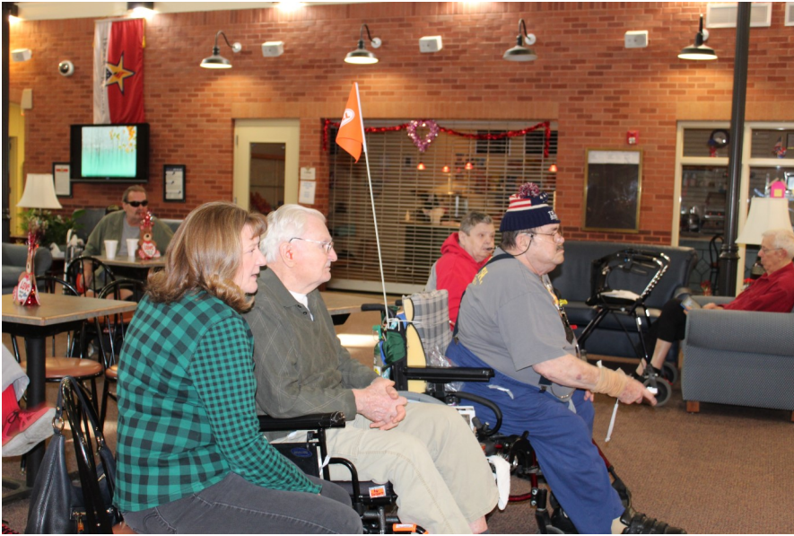
Wii Bowling in the Town Square