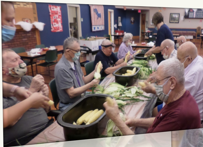
Left: NVH members enjoy shucking corn and reminiscing about farming.