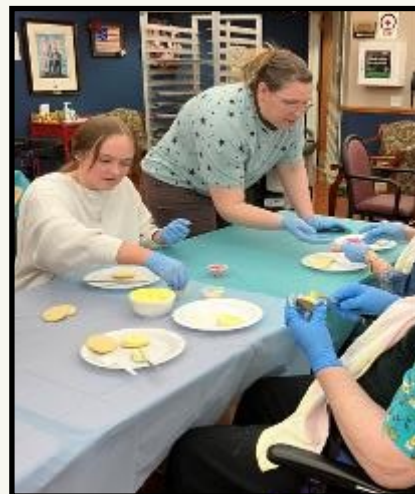
Members gathered to fill eggs with candy and decorate cookies for the "Happy Hopping" Easter event at Norfolk Veterans' Home.