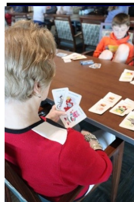
Right: An afternoon of games with Glenwood Elementary...is it a winning hand?

teachers was a teacher to one of our members. That was a great conversation to listen to and what a great unexpected connection. The kids that were playing games with that member thought coincidence was pretty cool too.