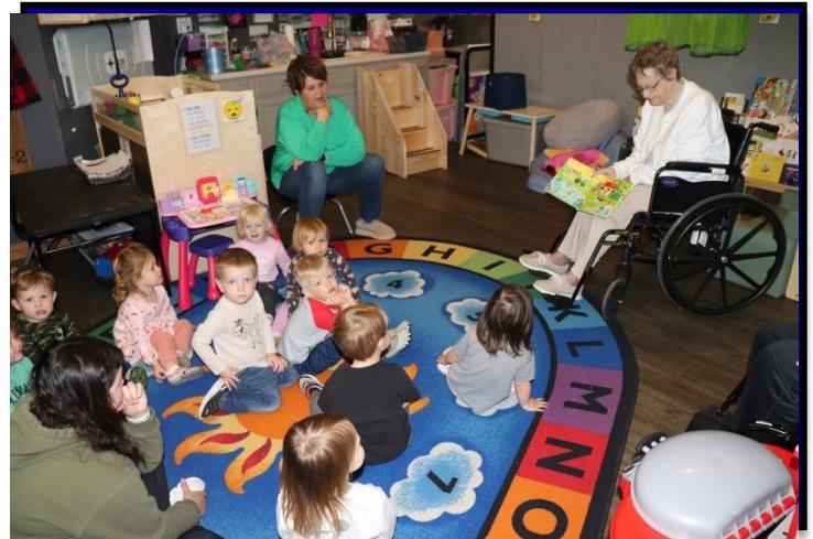
Above: The power of a great story at Read Across America with the Family Suite Learning Center.

The 3rd class joined us here at the facility for an afternoon to play games and interact with the members. There were a lot of conversations happening during the activity and one discovery was that the grandfather of one of the