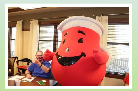
A big "thumbs up" to all who made Kool Aid Man's visit to CNVH so much fun (and also to those heroic staff who donned the costume and endured the heat and discomfort of walking all over campus!).

As he travelled the hallways, he brought smiles and hugs to all he encountered along the way.