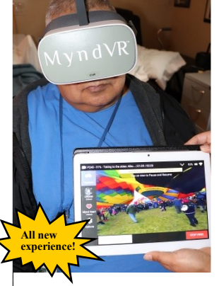
Trying out a virtual real ity headset.

Before it was offered to members, one of our staff, who is prone to motion sickness, tried it and never experienced any discomfort, but rather had a positive response. The headset allows someone to experience a wide variety of simulations such as swimming with sharks, sky diving, ballooning, interacting with animals and more. Joy seems to be the overwhelming response!