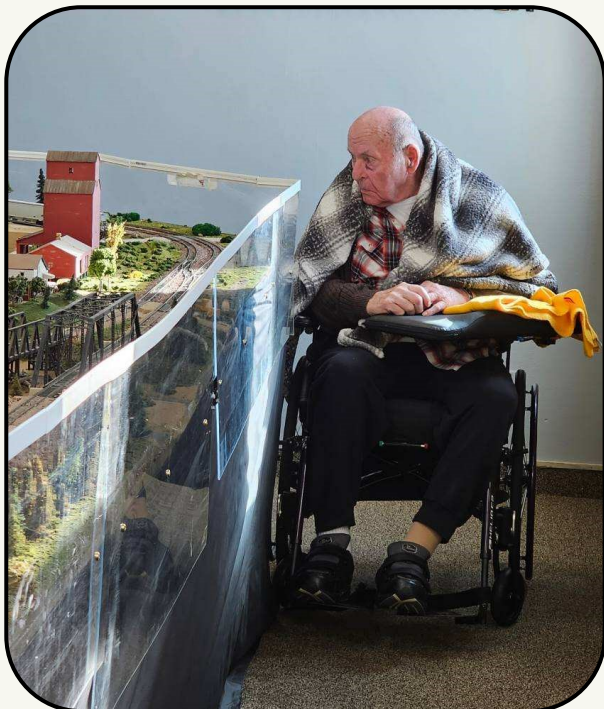
A group of members traveled to Barnstormers (the old airport terminal building) to look at the miniature train set display.