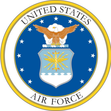
Russell M. Air Force