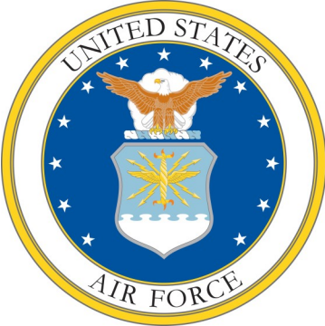
Alvin A. Air Force