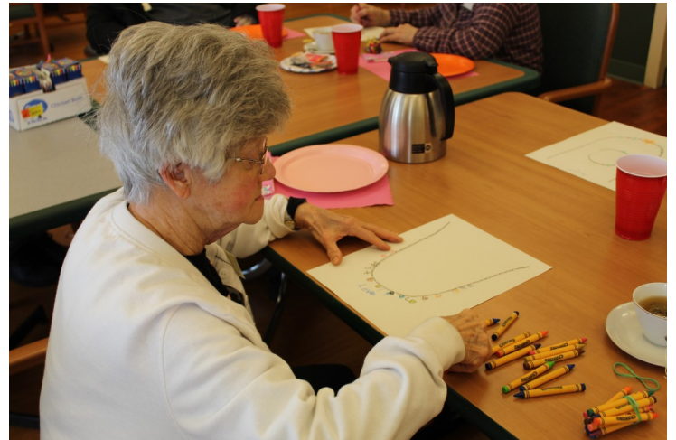
Members designed their own jewelry by drawing out necklaces and bracelets