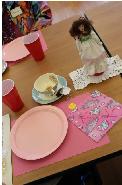
The tables were set-up with tea cups, porcelain dolls, and festive flatware