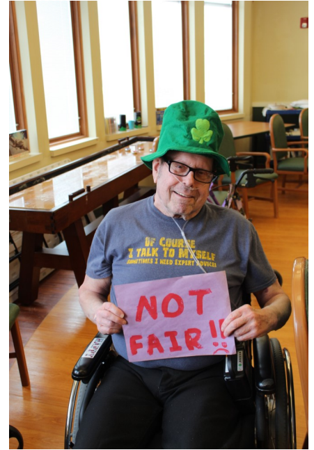
A male resident protesting the activity for "ladies only"