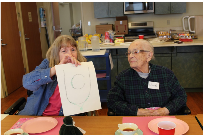
Members showing off their jewelry design

Sponsored by the Military Order of the Cootie Auxiliary & Military Order of the Purple Heart Auxiliary