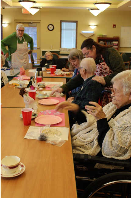
The ladies enjoyed tea, chicken croissants, assorted desserts, and jewelry provided by sponsors