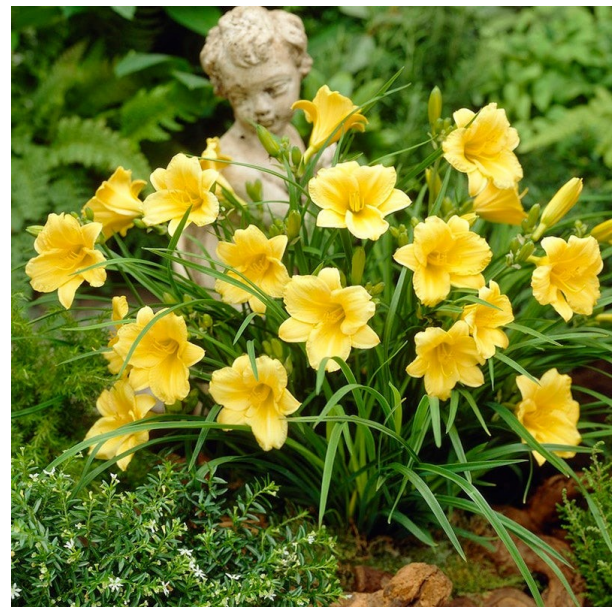
Stella D' Oro Reblooming Daylily

(Botanical Name: Hemerocallis Stella D' Oro)