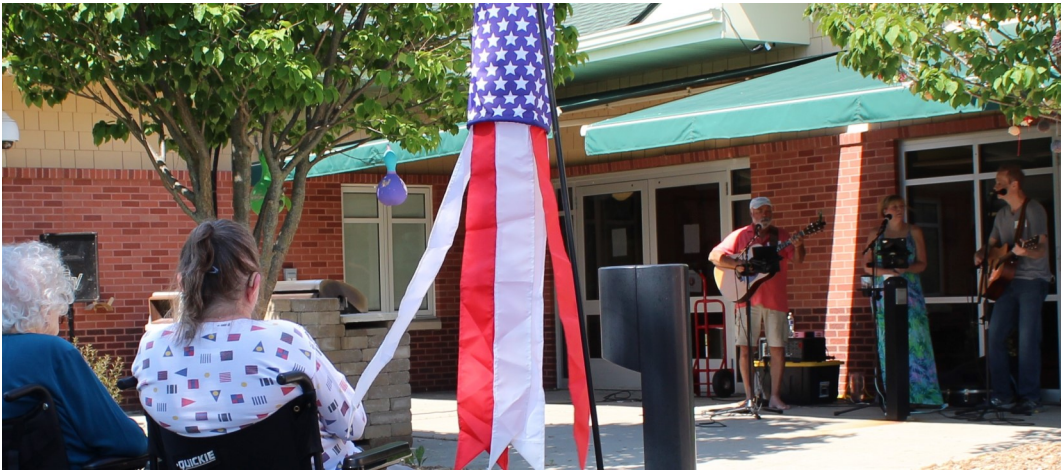
Music: The three member band called: Now & Forever performed for us in June.