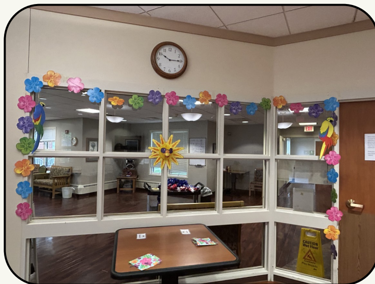
Pod F dining room.