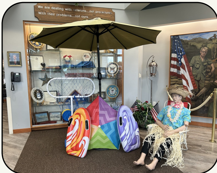
As soon as you entered the lobby area you could feel the tropical vibes.