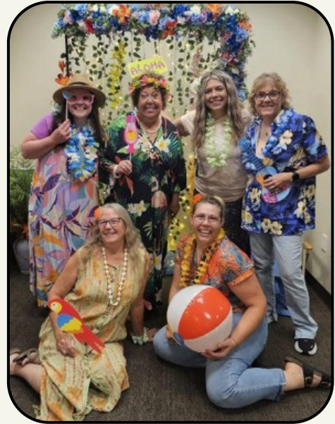
Above: NVH Activity Department

It is truly a pleasure to see the smiles on the faces of our Members and help make memories for them and their families. The title of the event says it all... " From the Heart ".