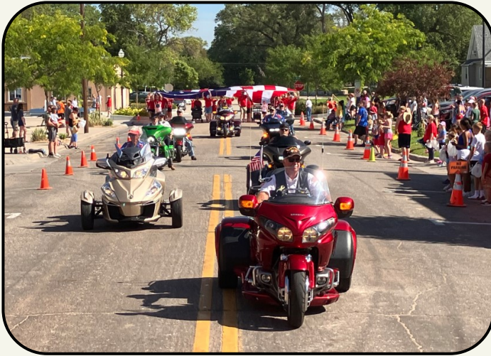
A group of veterans rode in the Norfolk Odd Fellows 4th of July Parade . Following the parade they had lunch at the Norfolk VFW.