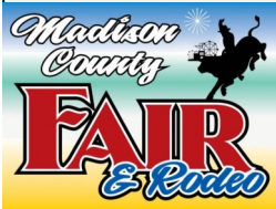
Members attended the Madison County Fair in Madison. Members got to look at many exhibits and even hold some birds. Before leaving they enjoyed some traditional fair food!