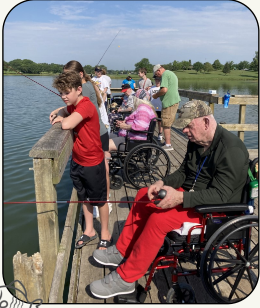
Members enjoyed fishing at Skyview Lake in Norfolk with the JOOI Club kids.