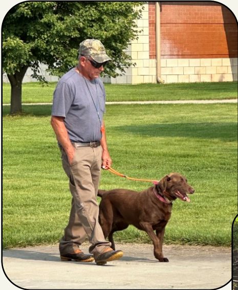
Elkhorn Valley Hunting Retriever Club showed members how their dogs are trained to be used in real-life hunting situations.