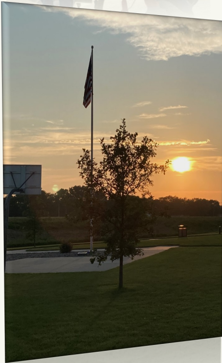
Below: Members' celebrated the Fourth of July with music, a peaceful sunset and a spectacular fireworks show.