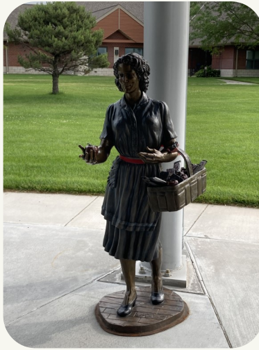
Left: "Our Canteen Lady" was recently added as a permanent fixture to Heroes' park.