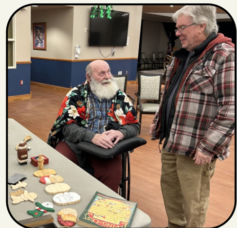
Local wood carvers displayed their talent with members.