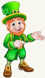
Unit F members spent the afternoon painting clay flower pots to look like leprechaun hats!