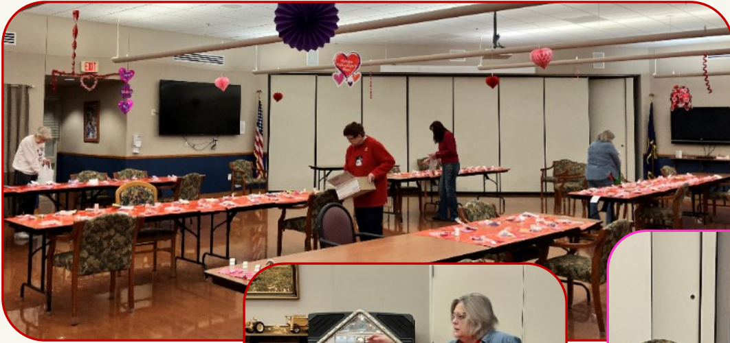
The Norfolk Nebraska Veterans of Foreign Wars Auxiliary helped stuff valentine bags for all the members.