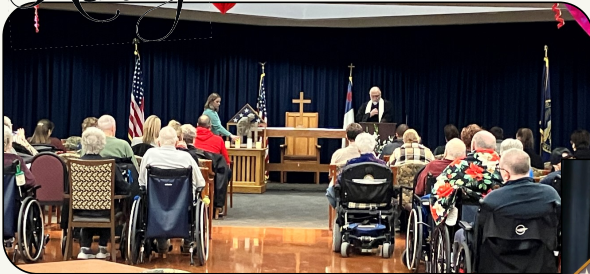
A Memorial Service for members who passed away in the past 6 months were recognized with a special candlelight service on February 19th. Norfolk Veterans of Foreign Wars posted colors and the Norfolk American Legion Riders served as the Honor Guard.