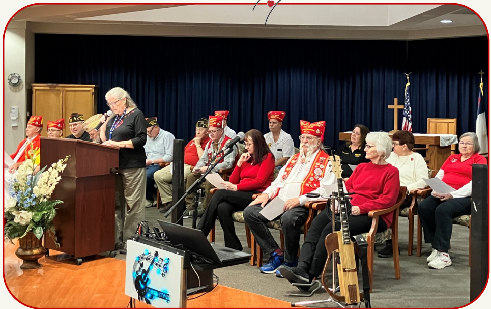
Above and Right: The Nebraska Department Veterans Foreign Wars, Nebraska Department of Foreign Wars Auxiliary and the Cooties sponsored a Valentine's Party for the members.