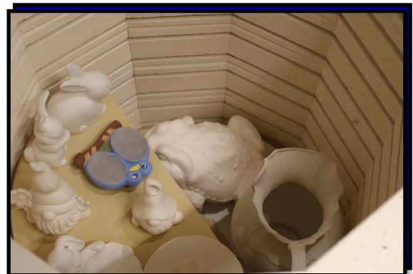
Ceramics placed in the kiln and ready to be fired.

est part of the project. Once it is done it will either be fired in the kiln a second time, or it may be sealed using a triple gloss sealant.