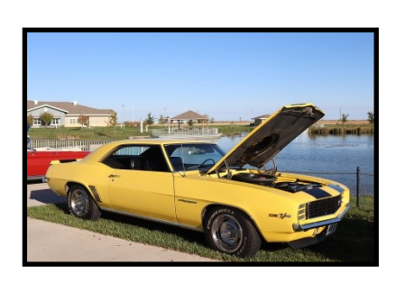
Members enjoyed looking at these classic beauties and reminiscing with the owners, volunteers and staff!