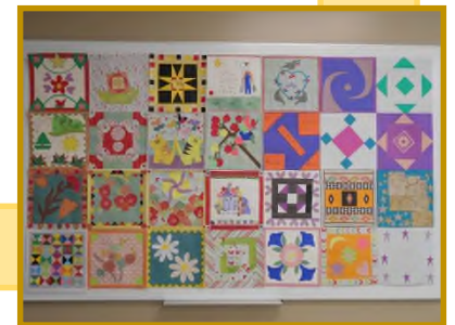
Painting & Woodwork!