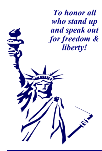
Page 2— Administrator's Notes