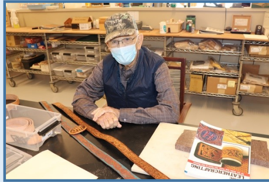
Members continue to enjoy their scheduled sessions in the Craft Department—ceramics, leatherwork, woodwork and other fun craft activities. Some have even started working on a County Fair exhibit piece!