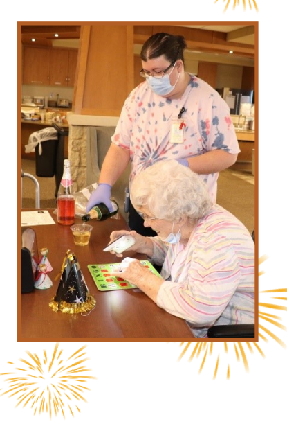
Everyone celebrated the conclusion of 2020, and greeted 2021 at the New Year's Eve parties sponsored by the American Legion Auxiliary.