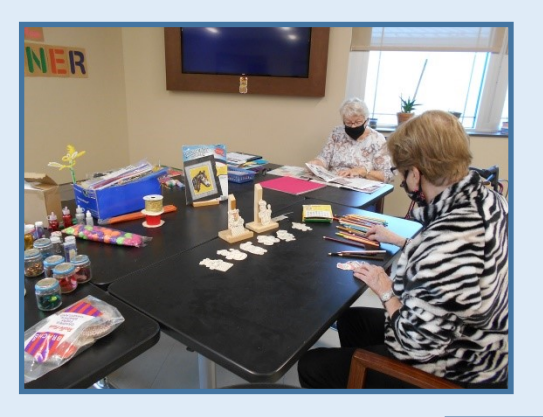
Busy Hands Are Happy Hands!