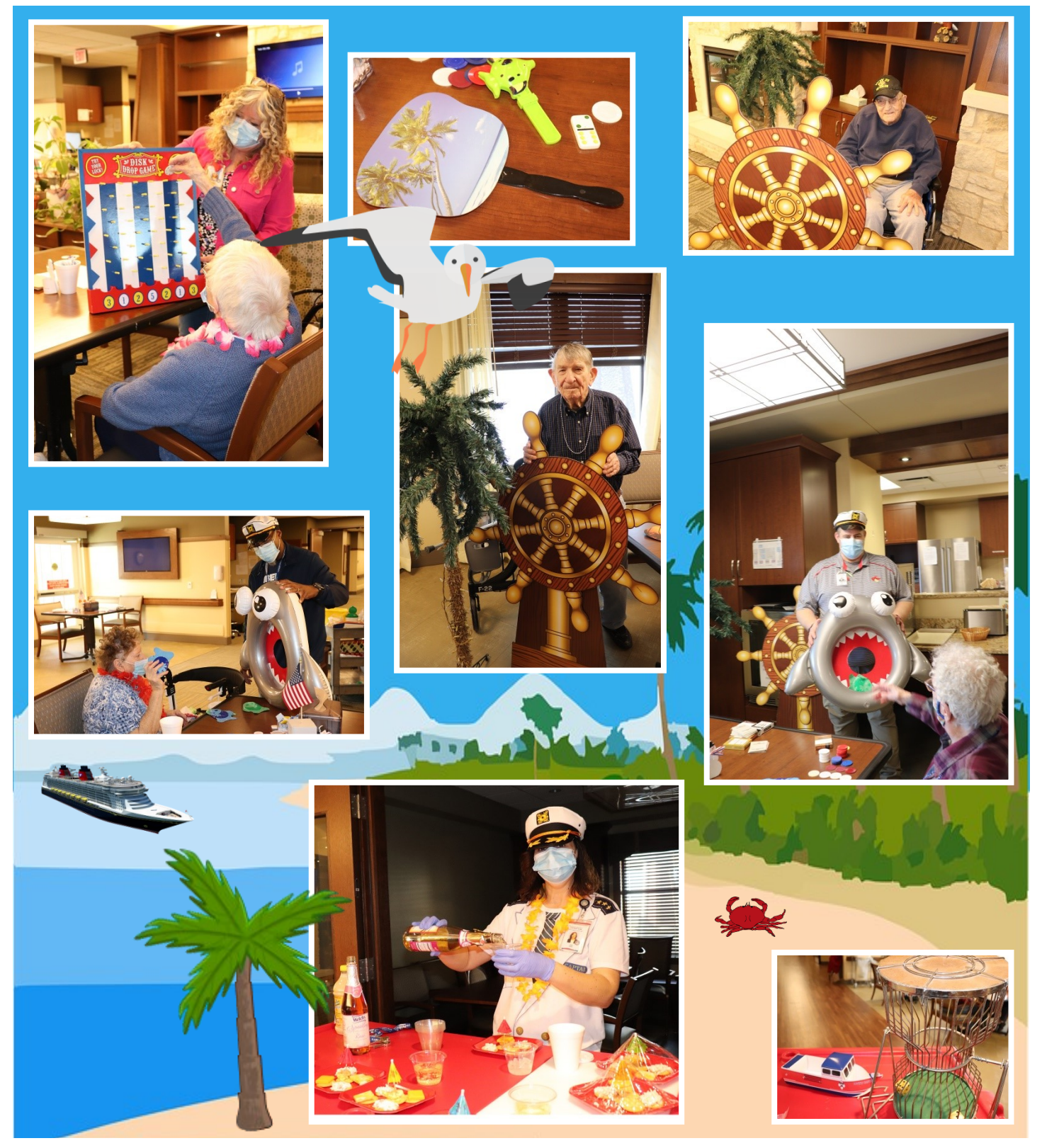
The Kearney Elks also sponsored an "Ocean Cruise Party" in January. Members set sail for warmer climates, playing fun games for prizes and coupons, and enjoyed some "bubbly" and hors d'oeuvres. The party concluded with a viewing of original episodes of "The Love Boat" TV show. A great way to chase away the "Winter Blues"!