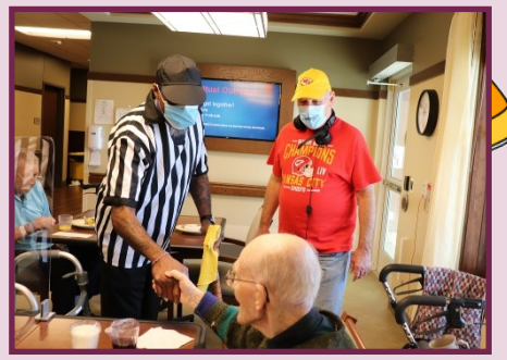
Members enjoyed greeting staff in costume, and sharing smiles and laughter.