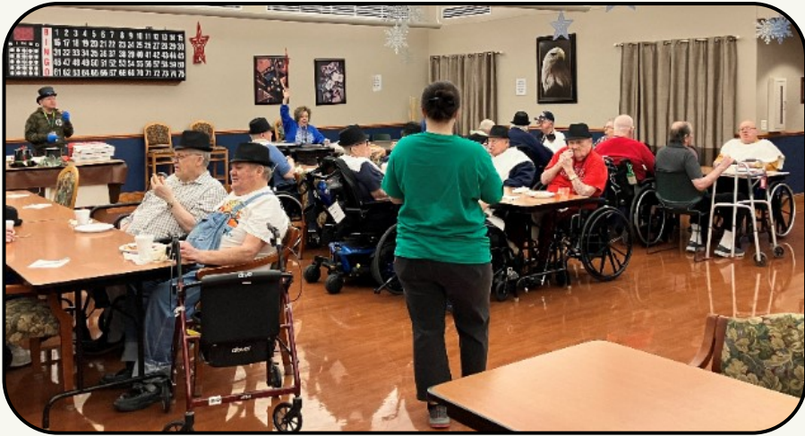
Men's Top Hat Pizza Party. Sponsored by Nebraska Dept. American Legion Auxiliary.