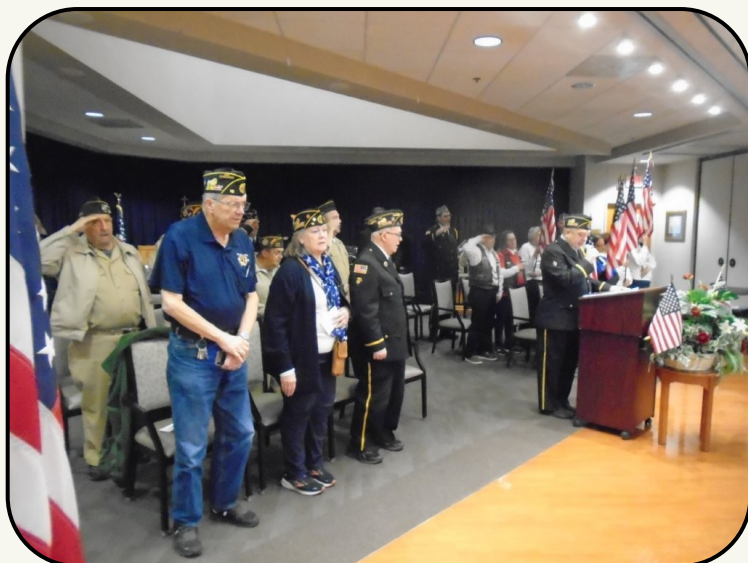
Veterans Day Program was held on Tuesday, Nov. 11th.