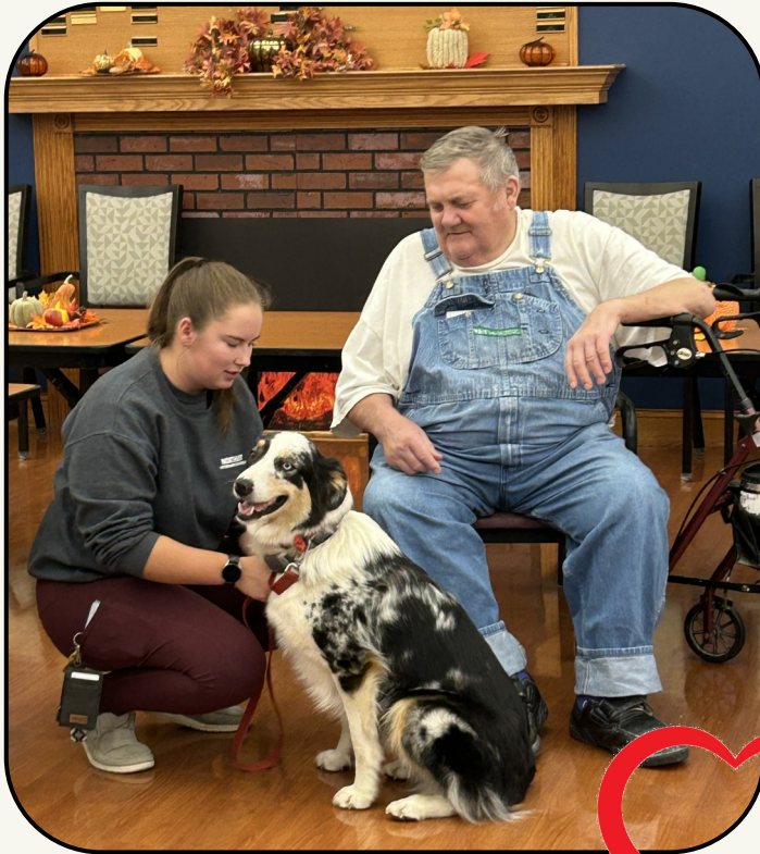
Pet Visits with the Northeast Community College (NECC) Vet Tech Club.