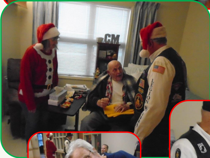
Pictured below are members receiving their gifts.