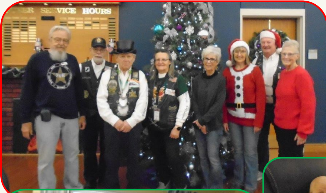
The Norfolk American Legion Riders strolled throughout the facility handing out cards and goodies to the members.