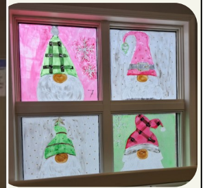
< Top two favorites >