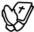
(74) Faith and Prayer