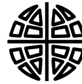
(72) Evangelical Lutheran Church