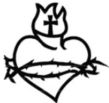
(62) Sacred Heart