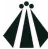
(65) Druid (Awen)