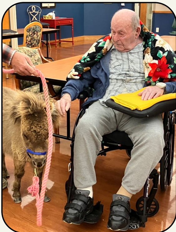
Dreamers Place from Wayne, Nebraska stopped by for a pet visit.